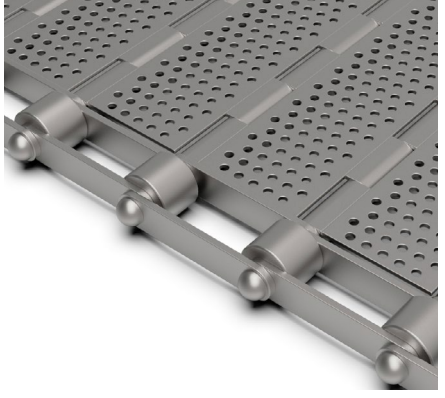
Plate Link Belt with a perforated surface.

Interested in the Plate Link Belt or need more information? Feel free to contact us!