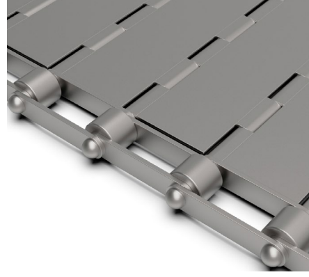
Plate Link Belt with a closed surface.

For more information regarding setup, possibilities, customization and options feel free to contact us!