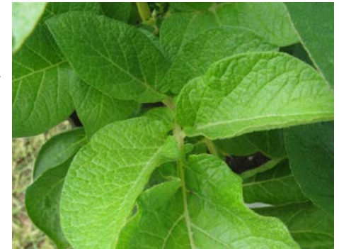
Figure 5.3 Sulphur deficiency

Farmers are advised to monitor the sulphur requirements of their crops. Where sulphur deficiency has previously occurred or is expected, apply 25 kg SO 3 /ha as a sulphate-containing fertiliser in the seedbed.