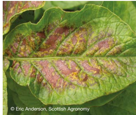
Figure 5.2 Magnesium deficiency