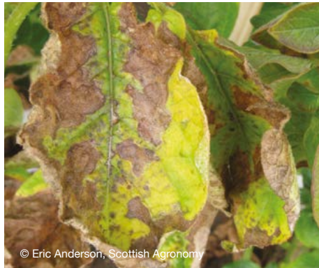
Figure 5.1 Potash deficiency

The amount of potash recommended at K Index 2 will only replace the amount removed by a 50 t/ha crop and potash should be applied for the next crop in the rotation to maintain the soil at K Index 2. The extra amounts of potash shown for K Index 0 and 1 soils will slowly increase the soil K Index.