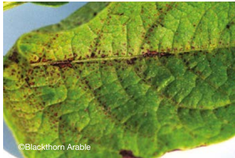
Figure 5.4 Manganese deficiency

Potatoes can tolerate a degree of soil acidity and are best grown at soil pH levels that are lower than for most other arable crops. However liming immediately before potatoes should be avoided unless the soil pH is very low, as this can increase the risk of common scab and manganese deficiency.